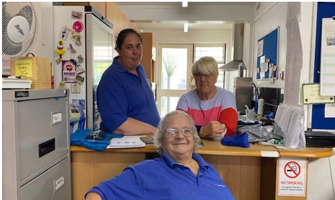
The Limestone House Daily Team